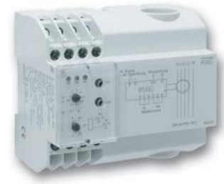
Residual current monitor IR 5882