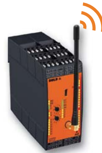
Radio controlled safety module UH 6900