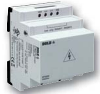
Coupling device RP 5898