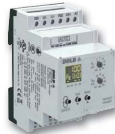
Insulation monitor RN 5897/020