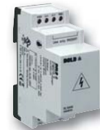
Coupling device RL 5898