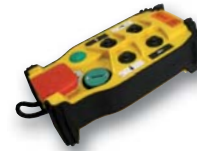
Handheld transmitter RE 5910