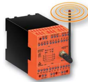
Wireless safety module BI 5910

Safety Integrity Level (SIL 3) in accordance with IEC/EN 61508