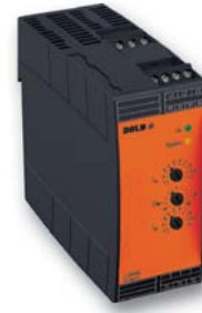
Softstarter UH 9018

The softstarter UH 9018 is suitable for challenging applications requiring reduced torque during start-up and run-down. The device ensures that the drive can start up smoothly. This precludes the drive elements from being damaged, because no abrupt starting torque occurs when the device is switched on directly. After a successful start-up, the power semiconductor is bridged using internal relay contacts in order to minimize loss within the device. The soft start function is designed to extend the natural run-down time of the drive, also preventing an abrupt stop.