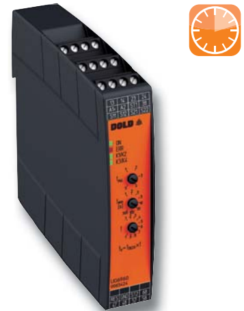
SAFEMASTER C - UG 6960 safe time and safety functions feasible