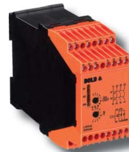
Standstill Monitor LH 5946

Cat. 4 / PL e according to DIN EN ISO 13849-I SIL CL 3 according to IEC/EN 62061 SIL 3 according to IEC/EN 61508, IEC/EN 61511 and EN 61800-5-2